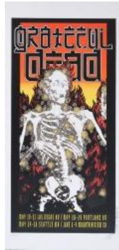
Grateful Dead by Alton Kelly

Alton Kelley contributed some 11 posters to the series, including this incredible Grateful Dead piece, a large poster.