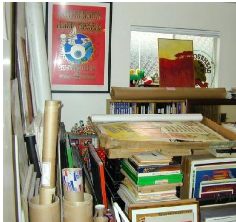
A Stash Room

Every serious poster collector has his stash of posters, whether it is under the bed, in the back of a closet, or in a special room. These special stash rooms, sometimes called "vaults" are always fascinating to visit.