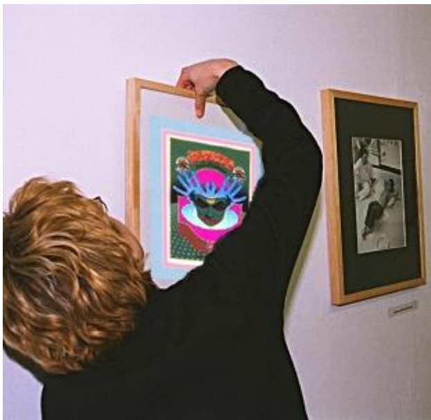
Get Them on the Wall

When I decorated the new headquarters of AMG (the All-Music Guide), when we moved it to Ann Arbor, I bought hundreds of posters and had them matted and framed. They lined the halls and meeting rooms and looked just great, everything from Boss Hog to Bob Dylan.