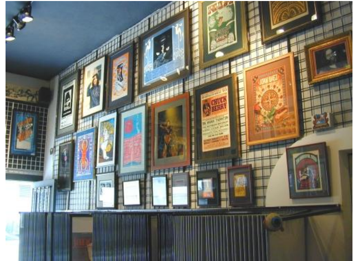
S.F. Rock Gallery