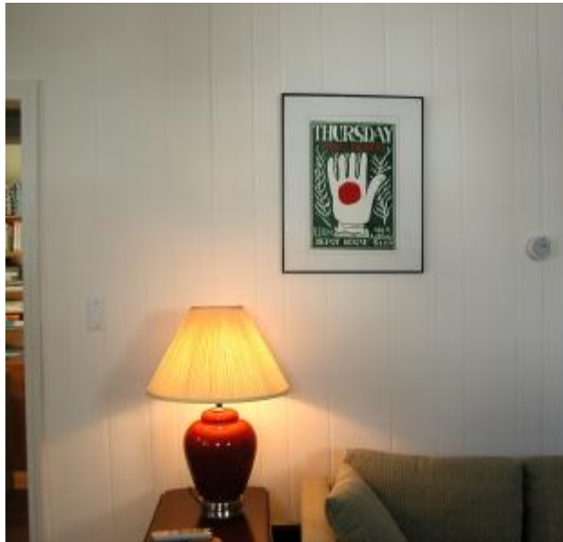
My Own Posters

At some point, I decided to take down the Klee prints, the O'Keefe, and the little batiks we had picked up at the flea markets and replace them, at least in some rooms, with rock and roll art - concert music posters. For one, I had to have some of the concert posters that I had designed and printed for my own band, back in the sixties, on the wall.