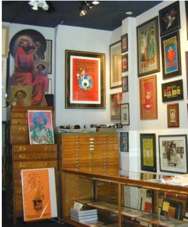
S.F. Rock in San Francisco

with posters and they look pretty great at that. Here are three views of San Francisco's S.F. Rock, one of the main stores for posters on the West Coast. As you can see, the walls are filled, but it is all very tastefully and effectively done. There is a lot to see.