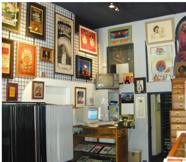
S.F. Rock Gallery