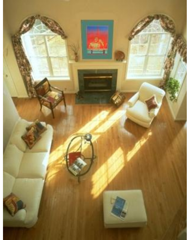
A Moscoso Adds a Touch of Elegance

My house happens to be pretty funky, but many of these posters are just elegant and look right at home in more elegant settings. True, you have to be just a little daring to do it, but who is looking, anyway? Who cares what we do in our own home? The two photos below give you some idea of how posters could look in what we might agree are very elegant homes.