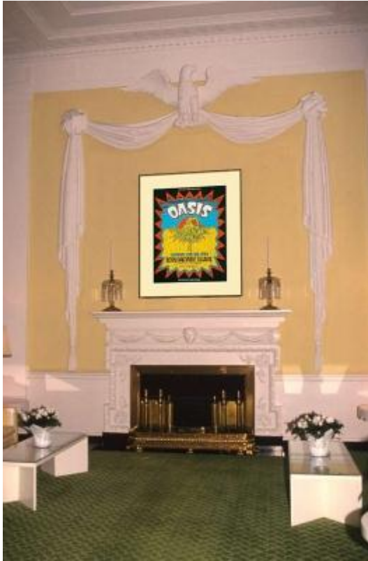
Well, perhaps palaces are not ready for concert posters

My house happens to be pretty funky, but many of these posters are just elegant and look right at home in more elegant settings. True, you have to be just a little daring to do it, but who is looking, anyway? Who cares what we do in our own home? The two photos below give you some idea of how posters could look in what we might agree are very elegant homes.