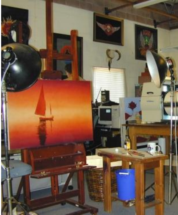
Stanley Mouse's Studio

Here is a shot of Stanley Mouse's studio. On the one hand you have a roomful of the most sophisticated computer printing equipment, large machines capable of printing off one perfect poster after another. Yet, as you can see, here is a canvas on which the artist is working, in a style about as ancient as you might imagine. What a contrast.