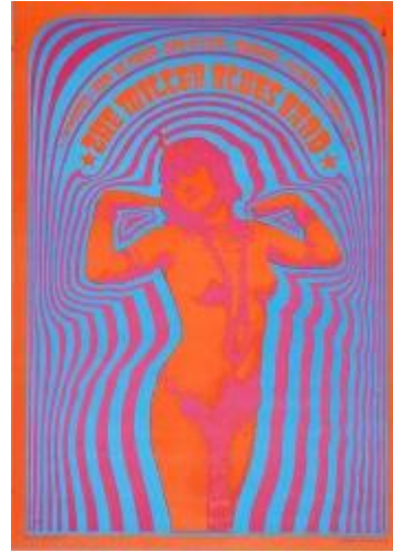
Neon Rose #2 Steve Miller Blues Band

The story of the Neon Rose series is important in the history of psychedelic posters for at least a couple of reasons. First, it is an example of some of the best psychedelic art ever created and marks perhaps the high-water mark of the pure use of color for that era. Moscoso is the master of psychedelic colors and vibrating colors, but always with exquisite taste.