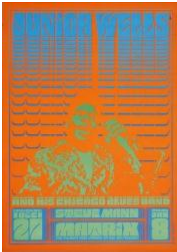
Neon Rose #18 Junior Wells

The Neon Rose set is classic psychedelic art and members of it have been displayed in museums around the world, including the Museum of Modern Art in NYC. The Neon Rose set is work of Victor Moscoso and probably marks a high-water mark in this artist's career. This particular set includes all 27 posters (0 through 26) and one variation (total of 27), 18 of them signed by the artist himself. These posters are mostly originals, but there are some reprints.