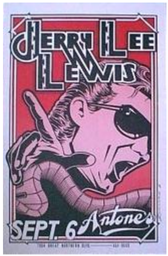
Classic Antone's Poster

Texas posters are one of the best values for collectors and are only just now beginning to be collected seriously. They have a great future.