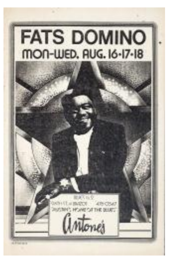
Classic Antone's Poster

Right up there with the Armadillo is probably the best blues club in the southwest, Antones in Austin, Texas.